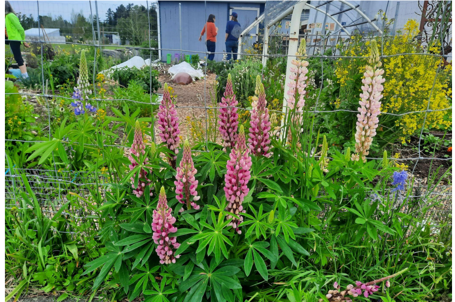
Colquitz Middle School, SD61